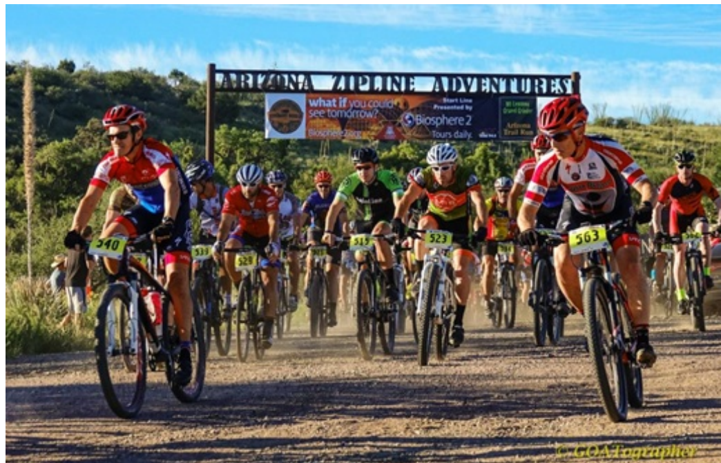
Contestants in last year's Gravel Grinder worked their way up the Catalinas.

The Friends offer 32 categories with more than 20,000 items. More than 60 volunteers are needed to help with everything from set up, tear down, including talliers, floaters and cashiers. The book